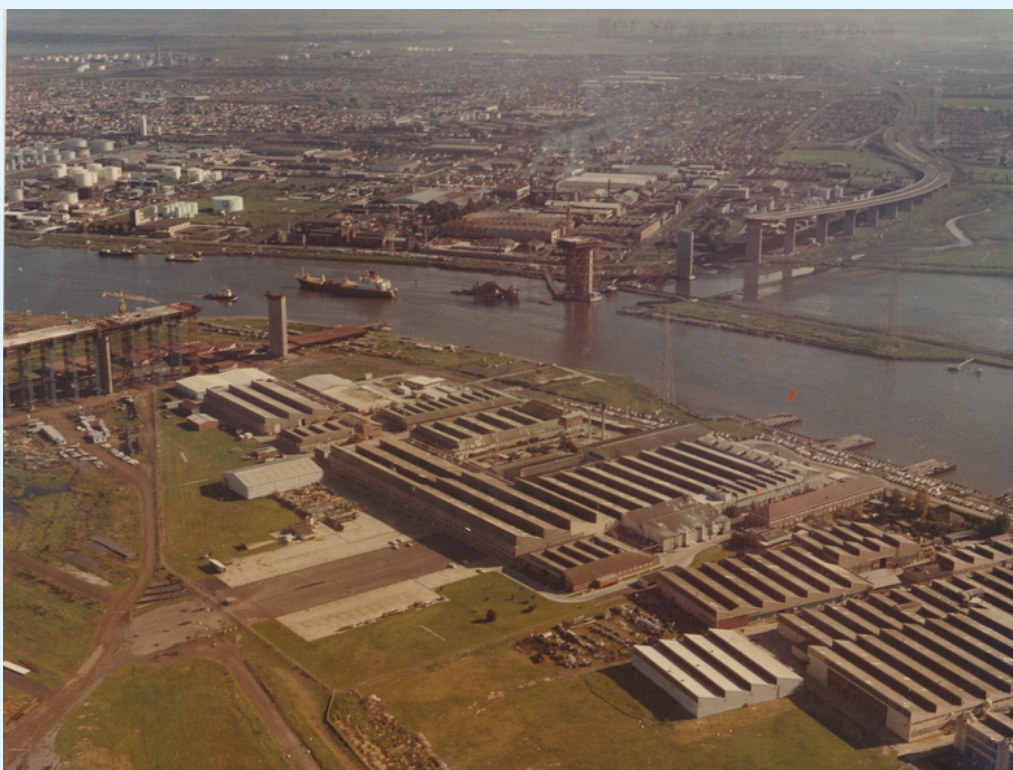
3662.01 Aerial view of West Gate Bridge Under Construction

Several factors combined to end Port's time as a centre of manufacturing. Firms were attracted by the cheaper land available in outer suburbs and later, tariff cuts of the 1980s meant industry moved overseas, it might almost now be called a dormitory suburb.