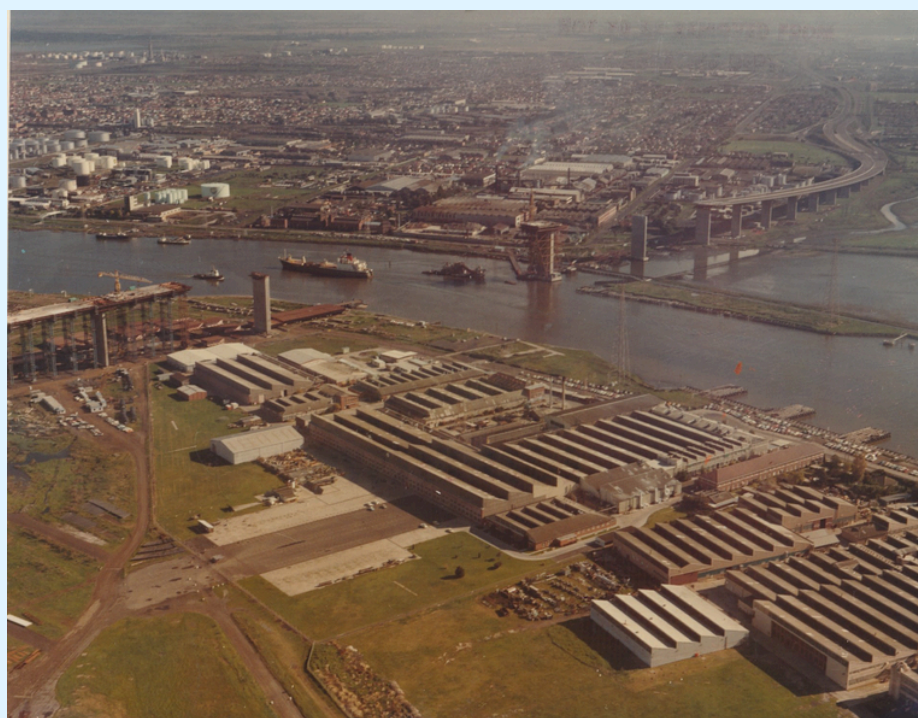
3662.01 Aerial view of West Gate Bridge Under Construction