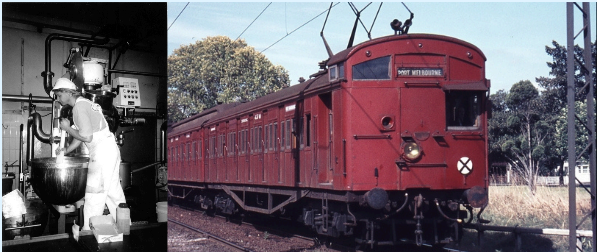
Lagoon Confectionary 963.07, Weston Langford11 2626: Graham - North Port Down Suburban 5-car Tait 437 M leading - https://www.westonlangford.com/images/photo/112626/ ,