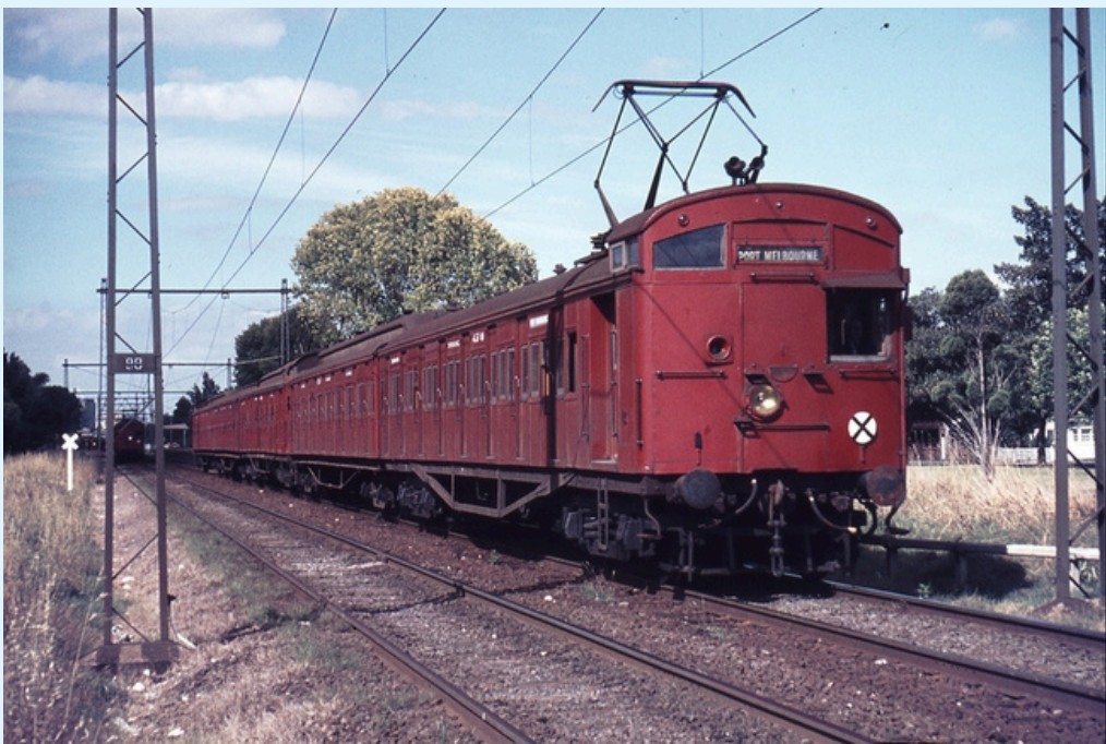
11 2626: Graham - North Port Down Suburban 5-car Tait 437 M leading

There was rapid development of war industries from 1937 to 1945 , particularly on the Fisherman's Bend. The workforce included many residents of Port, but the majority came from other suburbs by various means of public transport.