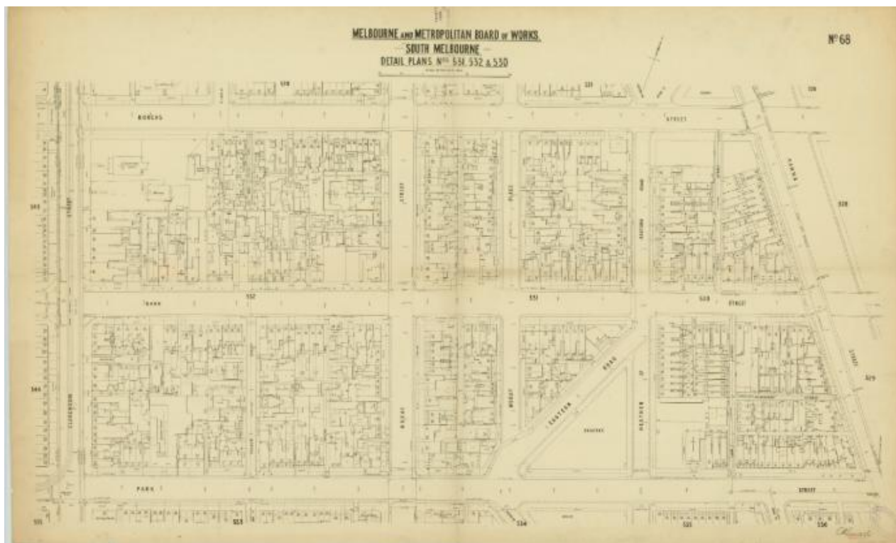
Melbourne and Metropolitan Board of Works detail plan. no. 531, 532 & 530, South Melbourne, 1895